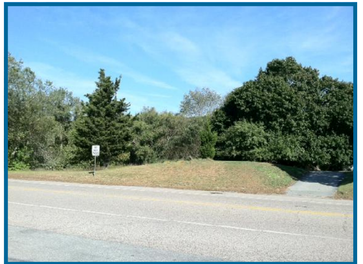
Entrance to property on Great Neck Road