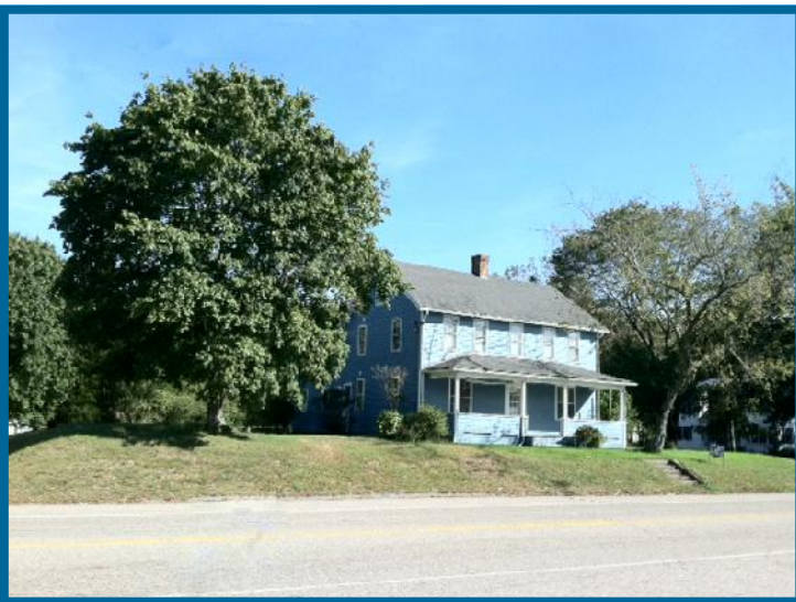
House on the property faces Great Neck Road