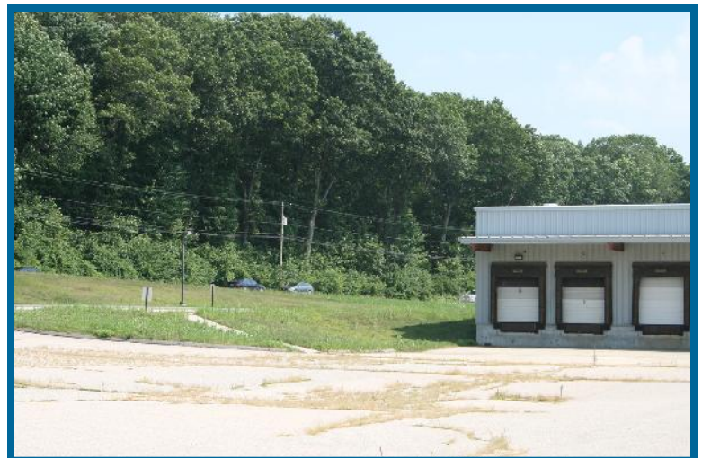
Great exposure to Route 32 traffic

All information stated is from sources deemed reliable and is submitted subject to errors, omissions, change of other terms and conditions, prior sale, lease, financing or withdrawal without notice.